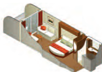
AquaClass Stateroom Stateroom: 194 sq ft (18 sq m) Balcony: 54 sq ft (5 sq m)