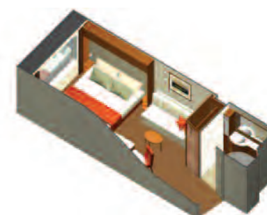
Ocean View Stateroom 177 sq ft (16 sq m)