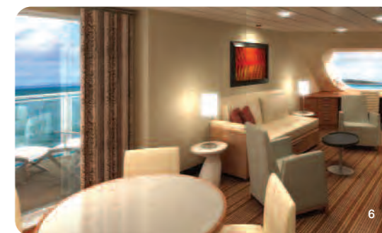
1. Royal Suite Dining Room 2. Balcony Stateroom 3. Celebrity Suite 4. Sky Suite 5. Penthouse Suite Bathroom 6. Family Ocean View Stateroom

The Celebrity Solstice images featured are artistic renderings and reflect the proposed design and layout. Design and layout are subject to change without notice.