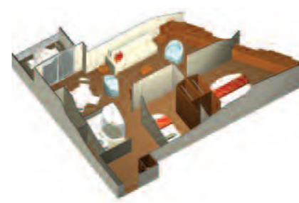
Family Ocean View Stateroom Stateroom: 575 sq ft (53 sq m) Balcony: 53-105 sq ft (5-10 sq m)