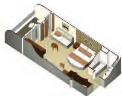
Sky Suite Stateroom: 300 sq ft (28 sq m) Balcony: 79 sq ft (7 sq m)

The Celebrity Solstice images featured are artistic renderings and reflect the proposed design and layout. Design and layout are subject to change without notice.