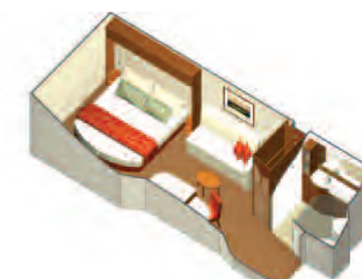
Interior Stateroom 183-200 sq ft (17-18.5 sq m)

Accommodation schematics shown are from Celebrity Solstice, which represents an example of a Solstice Class ship. Stateroom sizes may vary by ship and category. All measurements are approximate. Furniture configuration shown may vary in staterooms with third and fourth guest capacity. Drawings not to scale. Please contact our Reservations Department, your travel agent or cruise specialist for exact measurements. For full details of what is available in your stateroom or suite, please refer to pages 66-67.