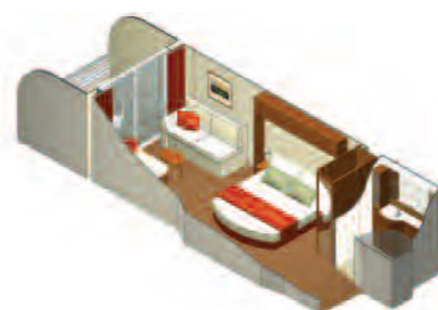
Celebrity Concierge Class Stateroom Stateroom: 194 sq ft (18 sq m) Balcony: 54 sq ft (5 sq m)